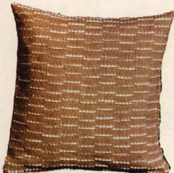
HWP503/C 19"x 19"