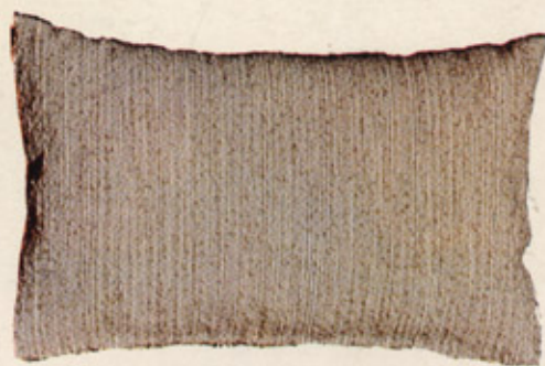
HWP405/E 11"x 17"