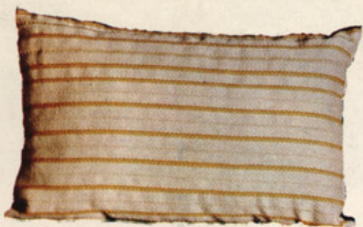
HWP402/D 11"x 17"