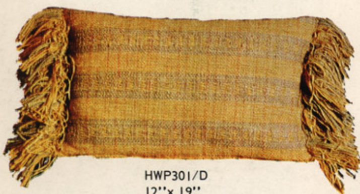
HWP301/D 12"x 19"