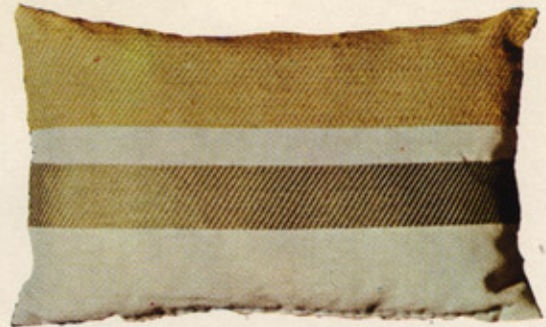
HWP401/D 11"x 17"