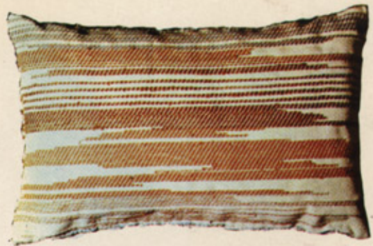
HWP403/E 11"x 17"