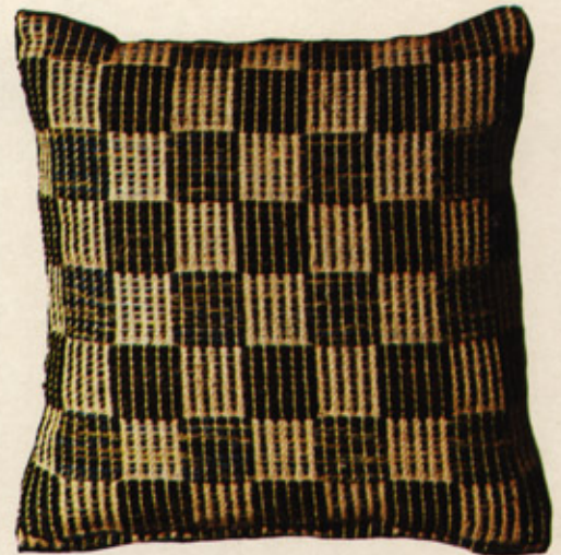
HWP502/D 16"x 16"