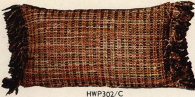
HWP302/C 11"x 17"