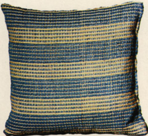
HWP501/C 16"x 16"