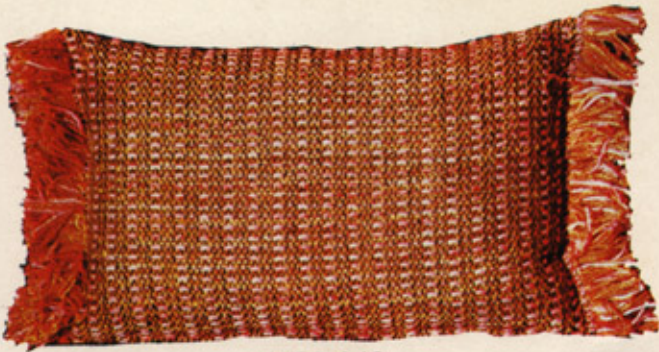
HWP302/C 11"x 17"