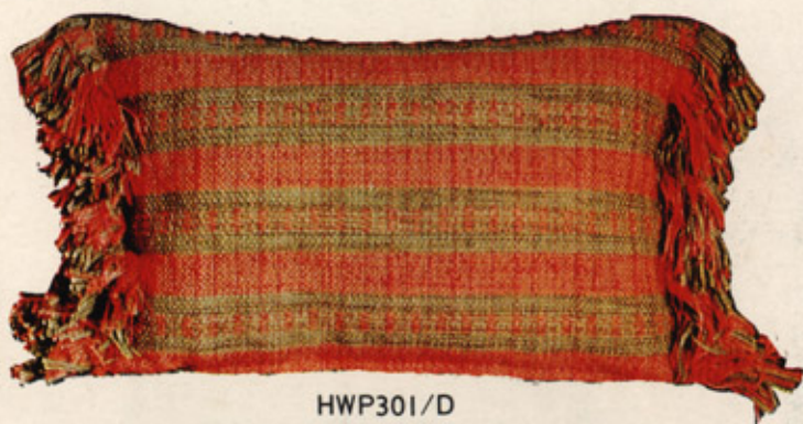
HWP301/D 12"x 19"