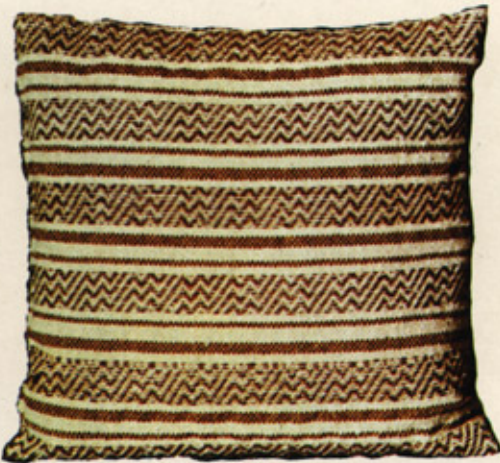
HWP303/D 16"x 16"