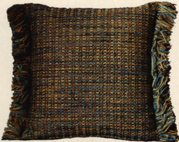
HWP302/C 16"x 16"