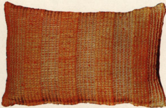
HWP501/C 12"x 19"