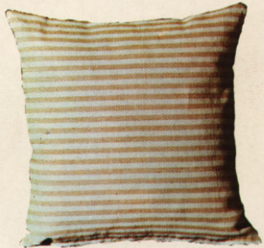
HWP201/B 16"x 16"