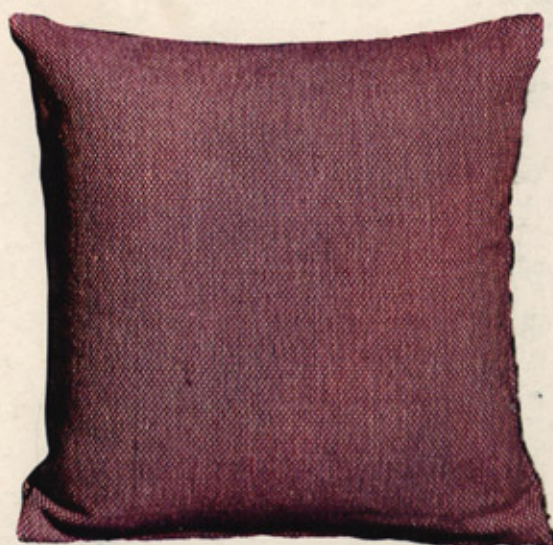
HWP101/A 19"x 19"