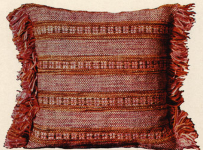
HWP301/D 16"x 16"